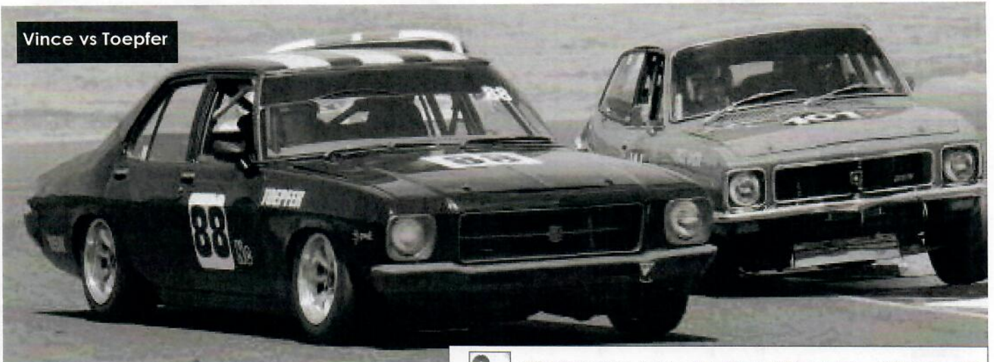
Vince vs Toepfer