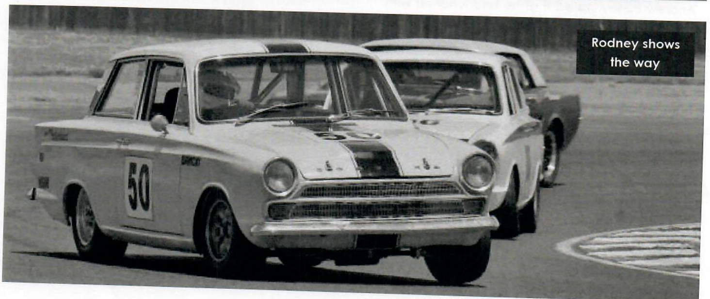
Rodney shows the way