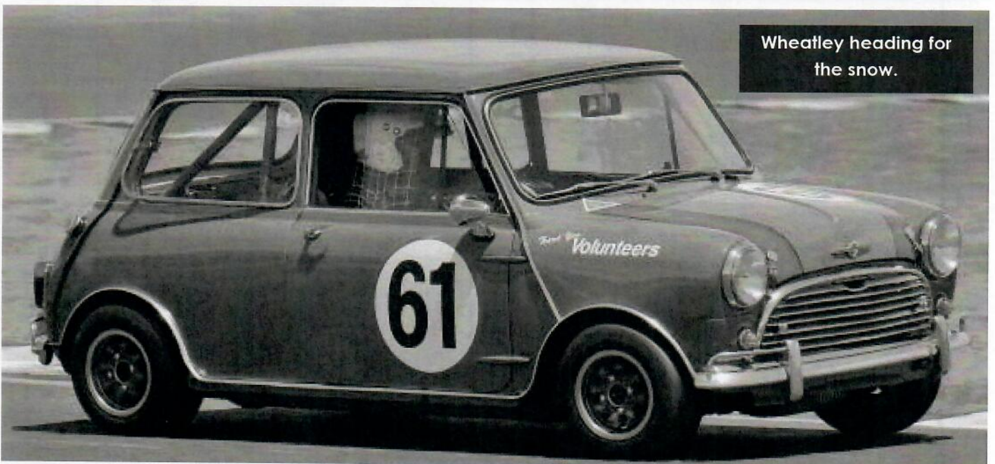
Wheatley heading for the snow.