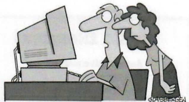
"THE COMPUTER SAYS I NEED TO UPGRADE MY BRAIN TO BE COMPATIBLE WITH ITS NEW SOFTWARE."

I asked my dad where the children came from, he said people download them from the internet!