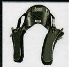
Pro Ultra Series