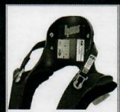
Sport II Series