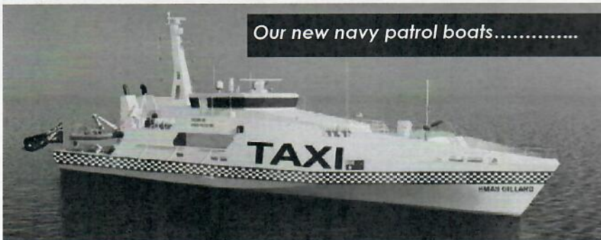
Our new navy patrol boats.....