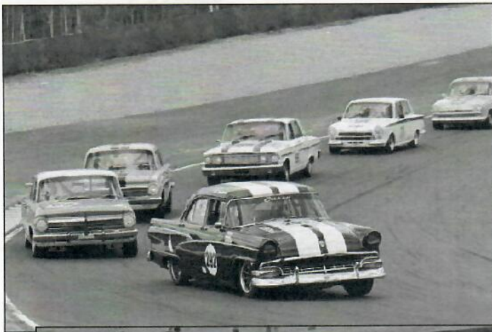
Photo Gallery - Muscle Car Masters 2012