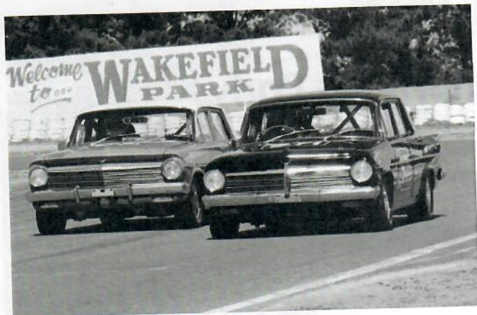
Photo Gallery - Wakefield September 2012